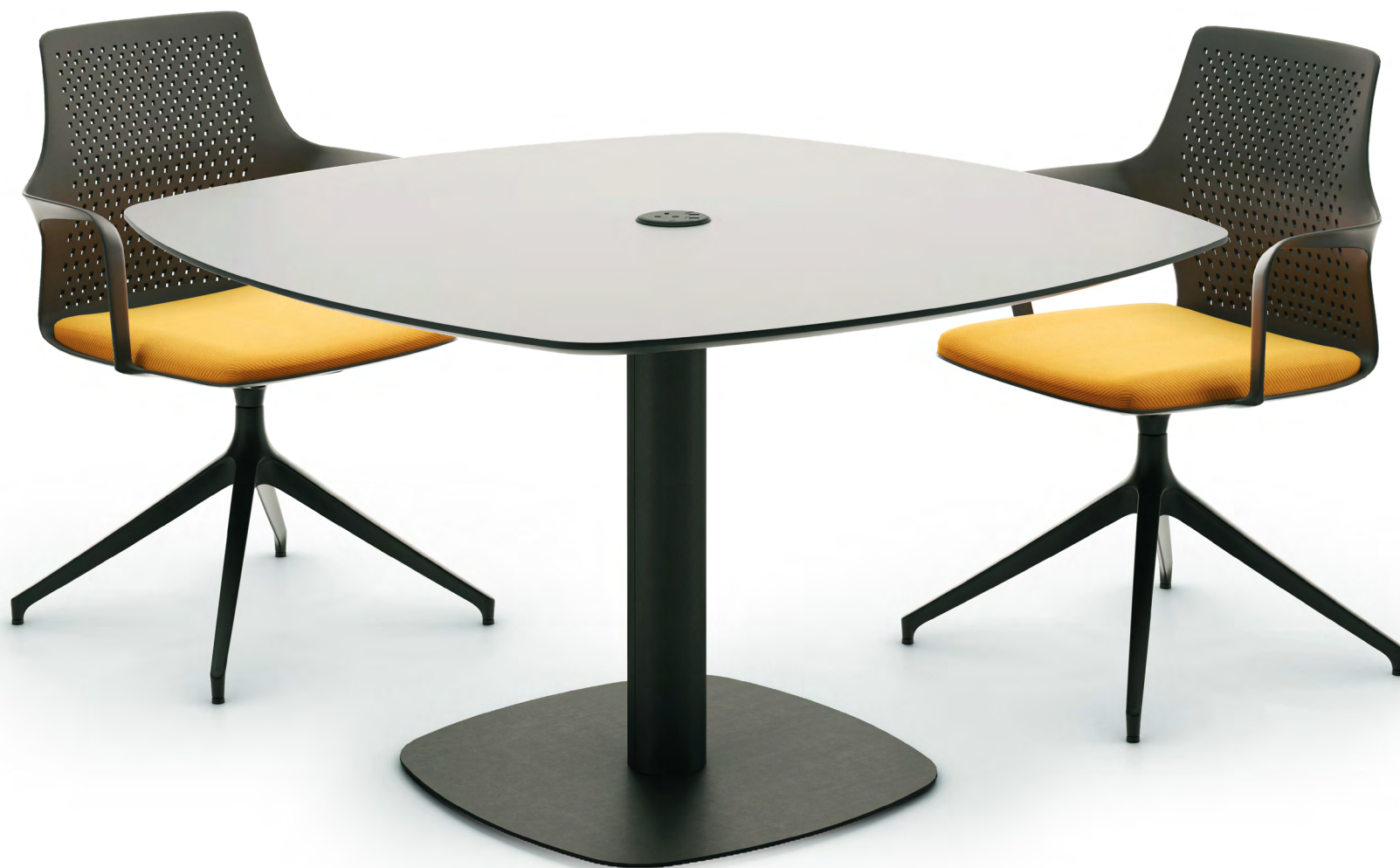
CONNA CN-MTSS-12 table with GEMMA GM22 chairs