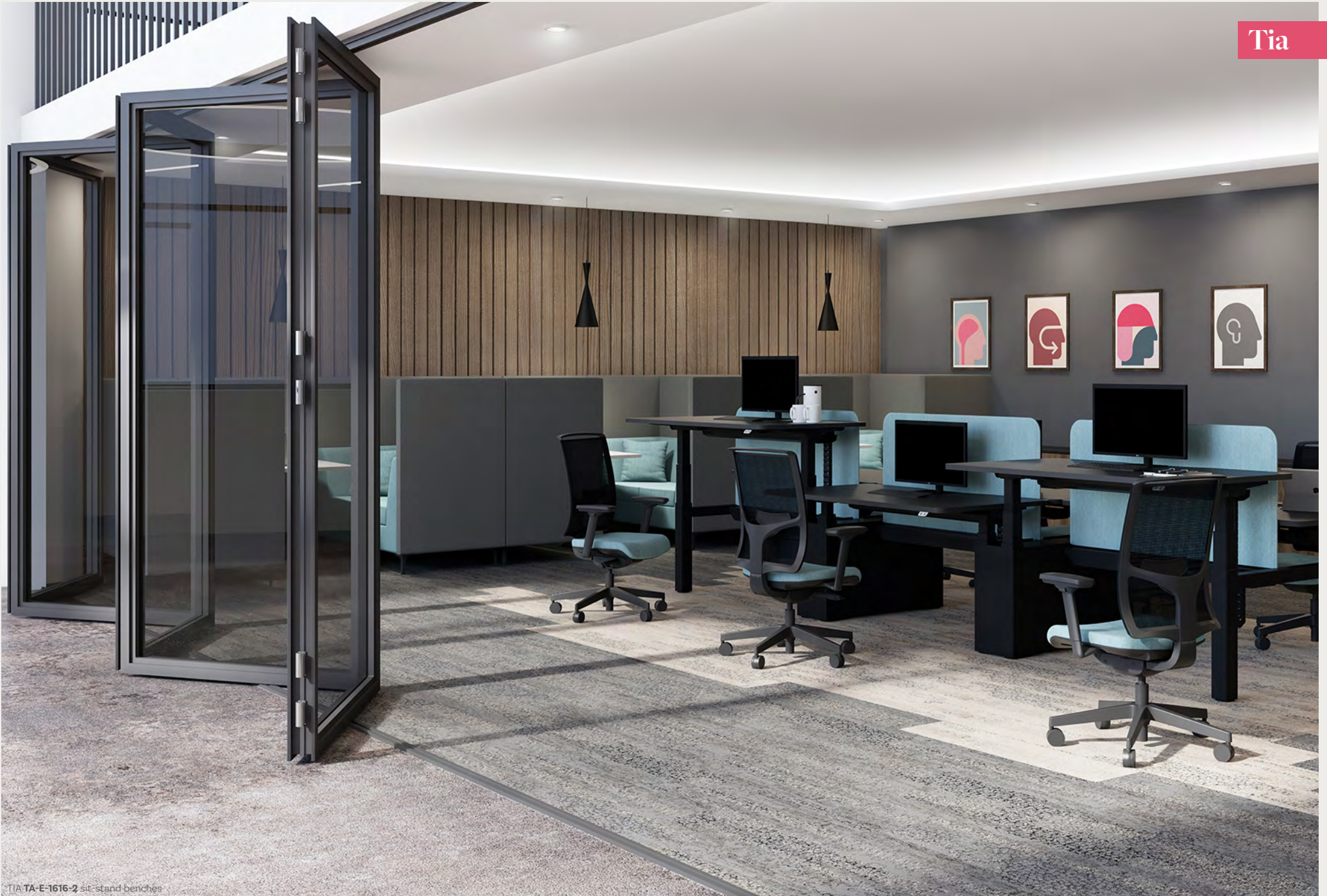
TIA TA-E-1616-2 sit-stand benches