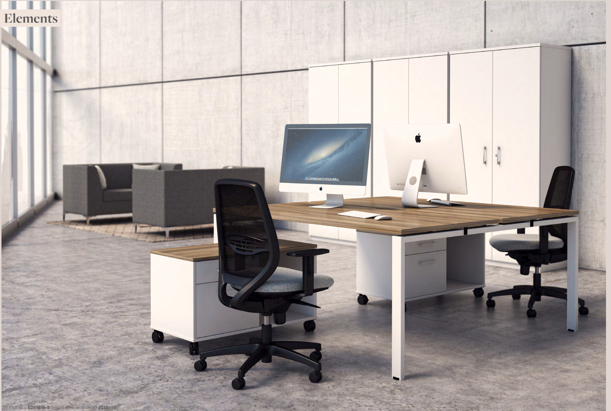
ELEMENTS EDS1616-2 bench desk with JAGO JG12 chair