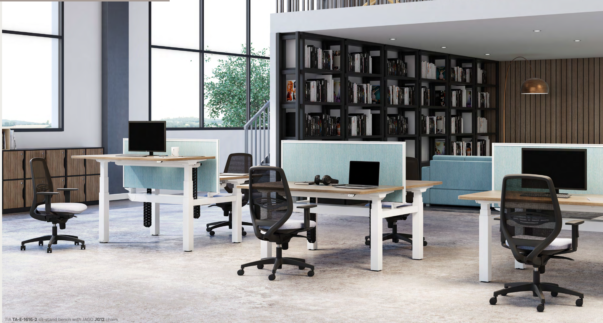
TIA TA-E-1616-2 sit-stand bench with JAGO JG12 chairs