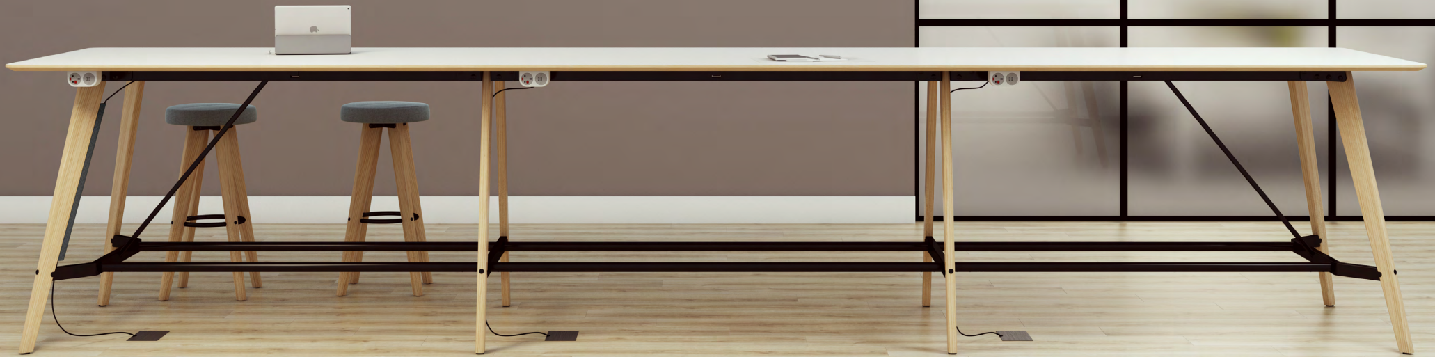
ARBY ARPR5410 high table